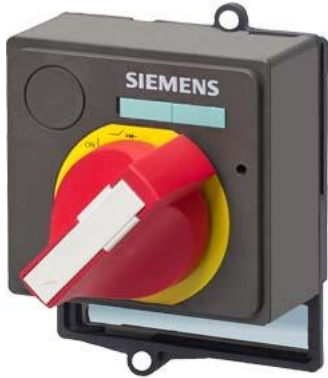
accessory for VL1250, VL1600, front mounted rotary operator EMERGENCY-OFF, red/yellow