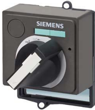
accessory for VL1250, VL1600, front mounted rotary operator standard