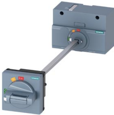
door mounted rotary operator standard IEC IP65 with door interlock accessory for: 3VA1 250